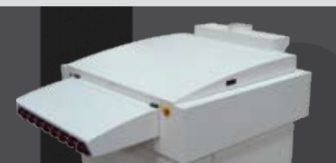
Many optional features Quartz Supreme Pre-bake Oven shown with front fume extraction cover, 500 mm driven feed table and rear heat extraction unit (all optional features).

A new conveyor program is developed in connection with the Supreme Post-bake Ovens and consists of a range of individual input and output conveyors.