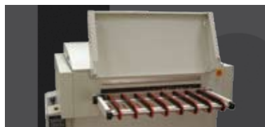
Optimal working environment The hinged fume extraction cover optimises airflow ensuring user-friendly environment.