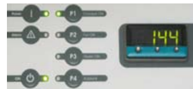
Simple and easy operation Select one of the pre-programmed programmes, turn the oven on, and it will be ready when the set temperature in the selected program is reached.